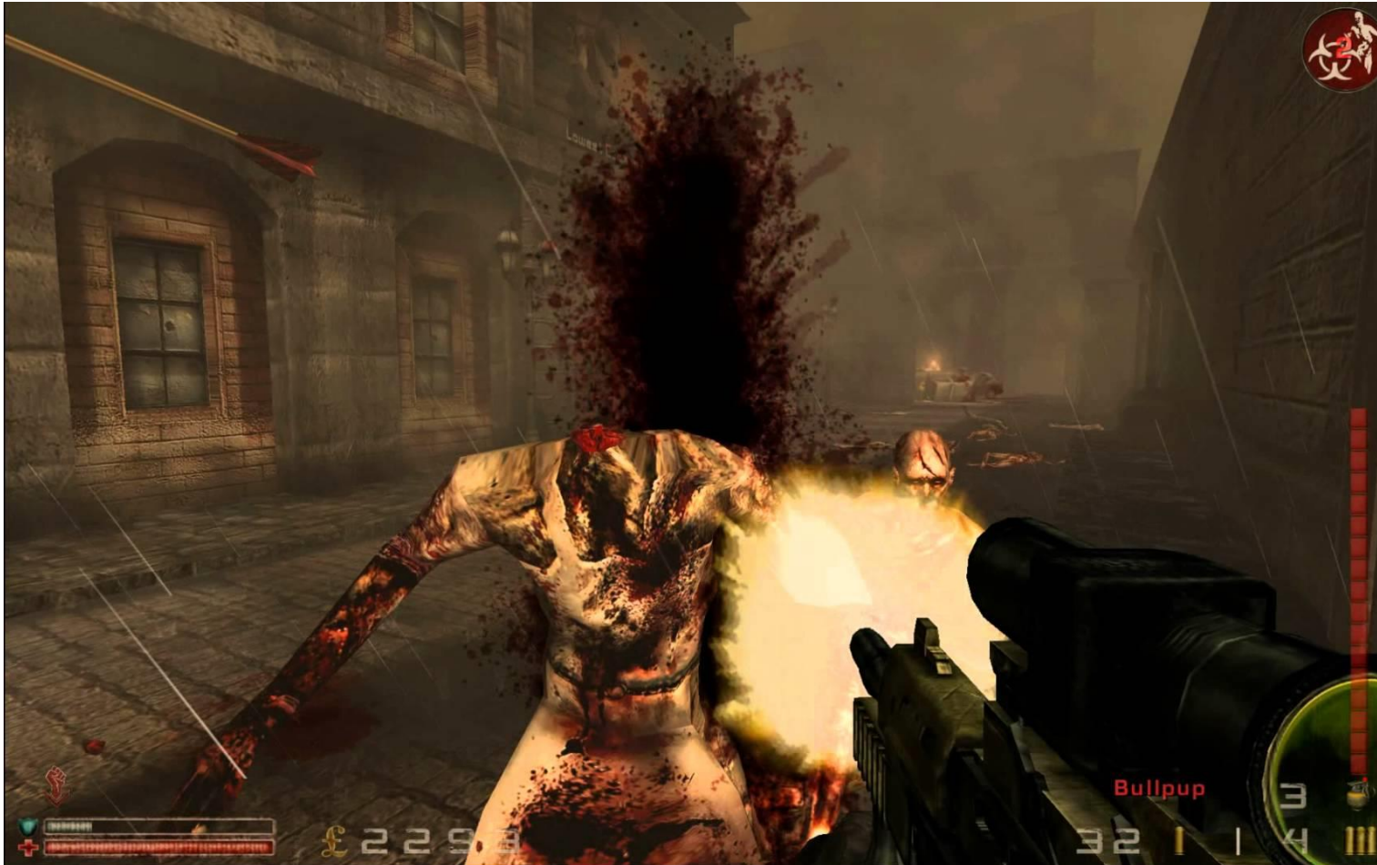
EXHIBIT 4 SCREENSHOTS Crida